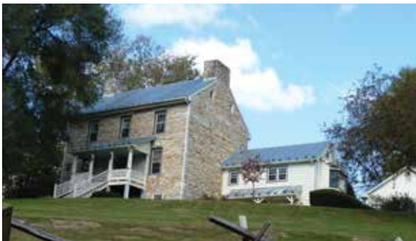
1774 Vineyard Hill near Buffalo Creek