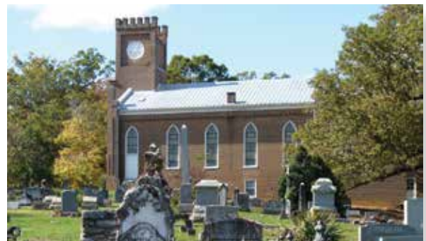
Ca. 1860 Falling Spring Presbyterian Church and Cemetery