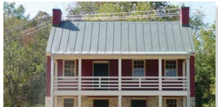
Miller's House--site of future Jordan's Point Museum