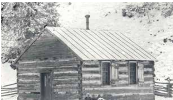
Archival photo of 1823 Hamilton School