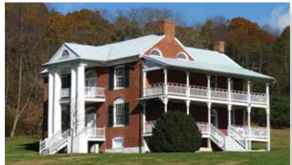
Ca. 1835 Paxton House in Glen Maury Park