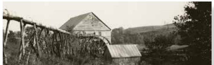
Beattys Mill at Whistle Creek