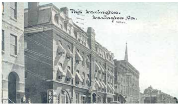
Lexington Hotel and Tutwiler Building

Further details, including priorities for grant funding, can be found on the HLF website www.historiclexington.org . An application form is available, but it is recommended that property owners first have informal conversations with HLF.