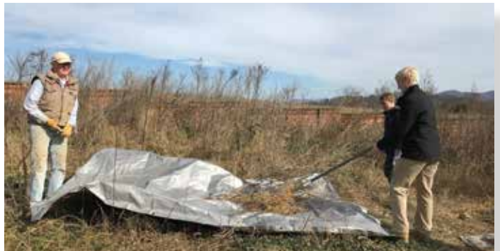
W&L students cleaning up the cemetery.