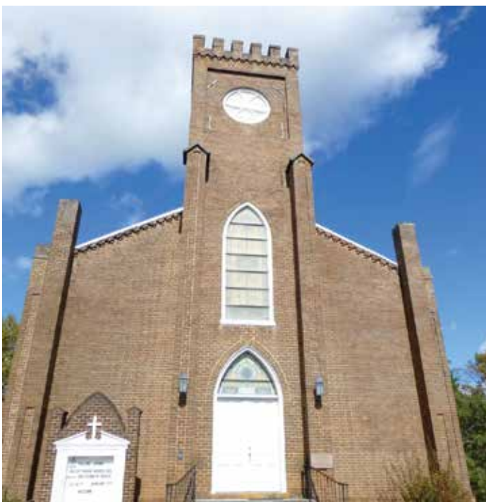
Falling Spring Presbyterian

Visitations are also planned for two historic churches in Collierstown. Collierstown United Methodist was organized in 1837. The main block of this brick church dates from 1840. The tower and steeple are 20 th century additions. Collierstown Presbyterian was organized in the early 1840s. Standing on the banks of Colliers Creek, the square brick building of 1856 is an important example of the Greek Revival style in Rockbridge County. The building is crowned with a large cupola. A cemetery adjoins.