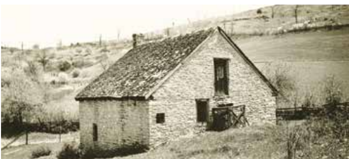
Stillhouse at Willson Farm