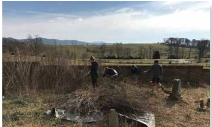
W&L students clean around historic gravestones.