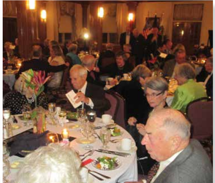
Guests enjoy the gala dinner at Moody Hall, Nov. 4, 2016.