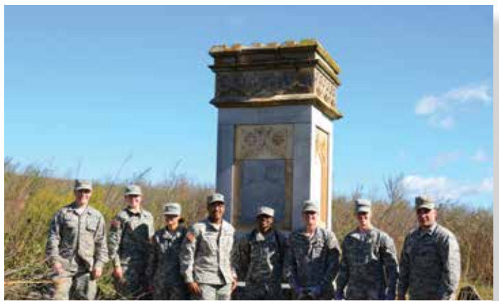
VMI cadets in front of McDowell memorial.