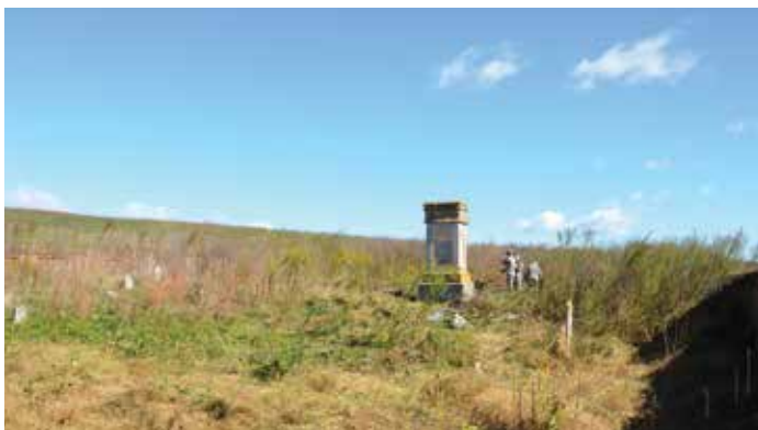
VMI cadets helped clean up the cemetery.