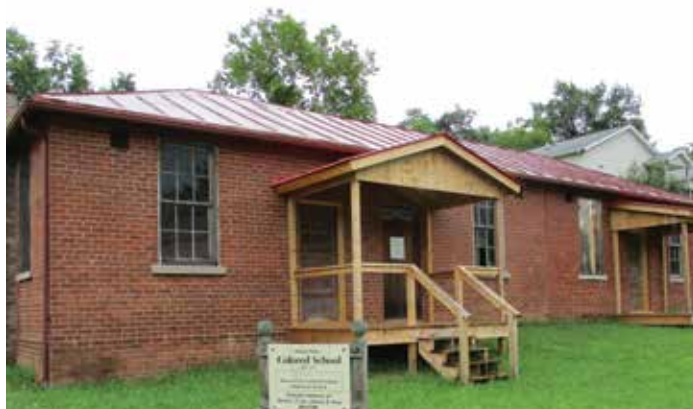
Buena Vista Colored School.