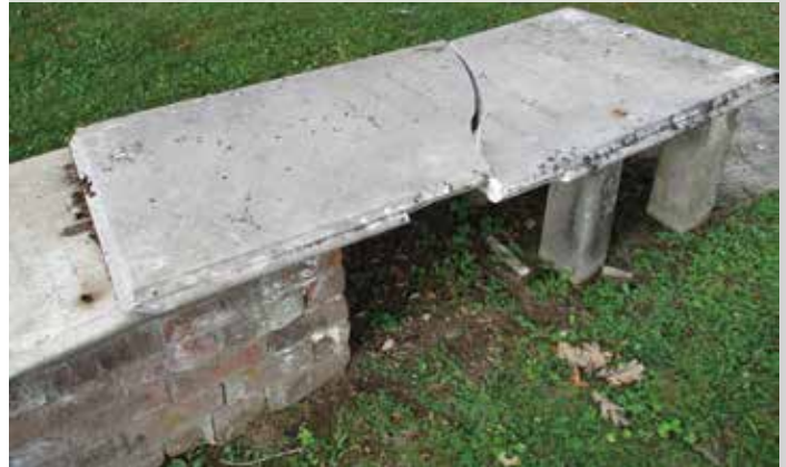
Gravestone of the Thomases on top of the stump.