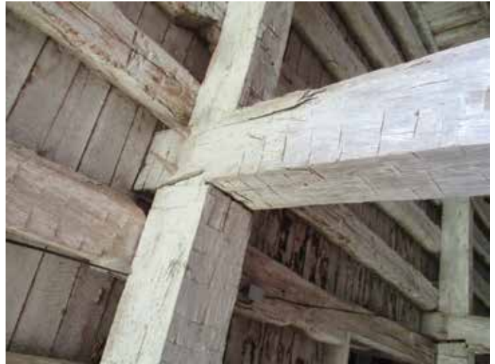
The antebellum barn at Hickory Hill reveals the anatomy of an historic Rockbridge barn.

Please let us know your thoughts on the subject and how you would like to get involved.