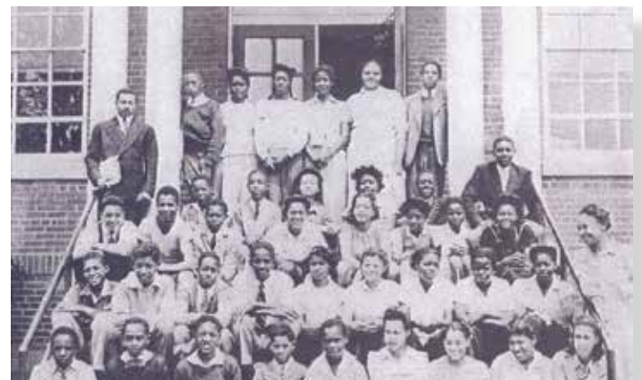
First day of class at Lylburn Downing, 1946.