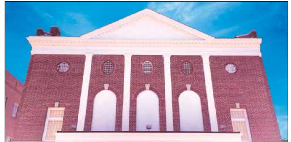
Top: 123 South Randolph Street (Blue Lab Brewing Company), 2014 Center: 101 West Nelson Street (The Palms), 2015 Bottom: 12 West Nelson Street (State Theatre), 2015