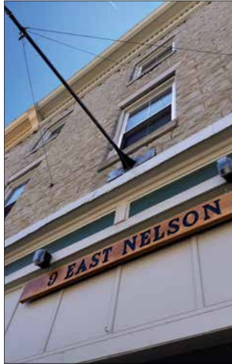
Clockwise from above: 14 East Nelson Street Building, 2014 9 East Nelson Street Building, 2015 18 East Nelson Street (vintage furniture store, Yesterday Once More), 2013