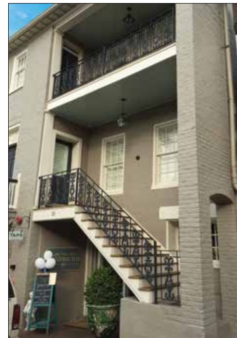
Left: 2 North Main Street (Alexander-Withrow House), 2014 Below left: 11 North Main Street (McCampbell Inn), 2014 Directly below: 103 North Main Street (First Baptist Church steeple), 2014