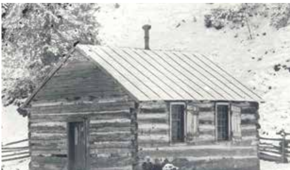
Archival photo of 1823 Hamilton School