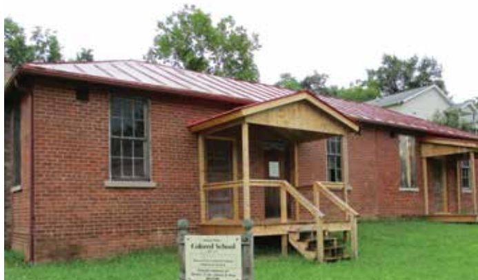
Buena Vista Colored School.