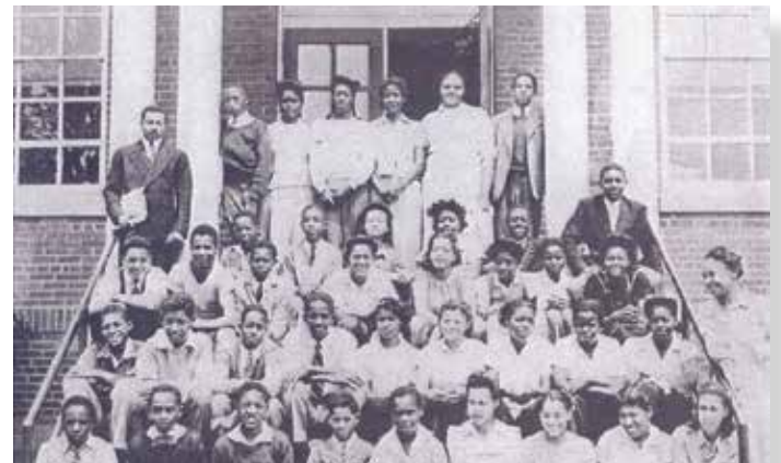
First day of class at Lylburn Downing, 1946.